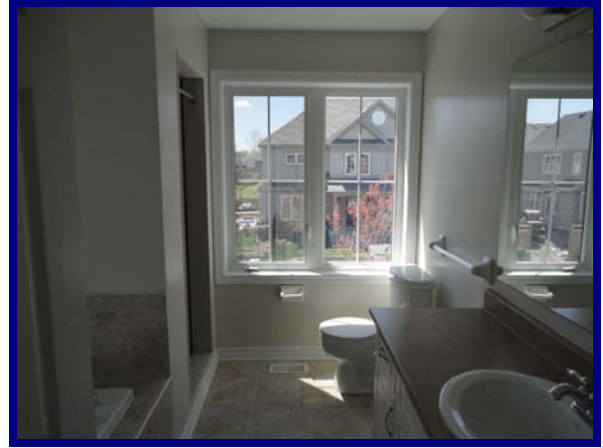
4 Piece Master Ensuite