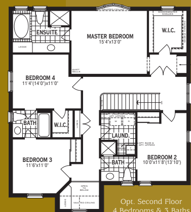
Opt. Second Floor 4 Bedrooms & 3 Baths